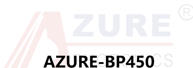
BP450 Transmission Data(Typical)